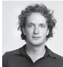
Designer: Yves Béhar